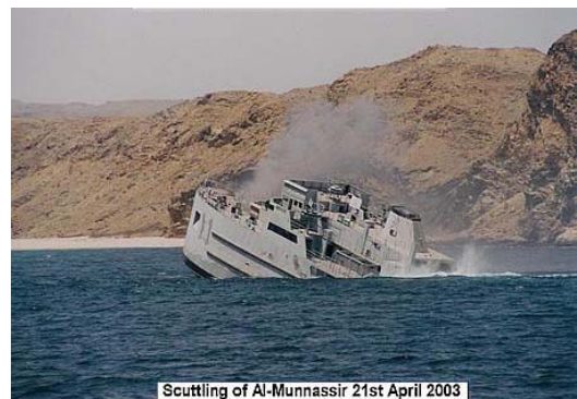
Scuttling of Al-Munnassir 21st April 2003

After its useful life as a landing craft came to an end, the al Munasir was intentionally sunk by the Royal Navy of Oman. It now serves as an artificial reef and as an attraction for divers. The visibility however was a bit limited due to lots of algae in the water. The wreck is easily penetrated by qualified wreck divers. This has been made easy due to numerous large openings in the ship's hull. Openings have also been made in the decks, allowing vertical penetration.